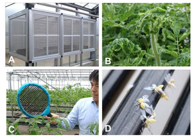
Fig 2 (A) An electrostatic nursery shelter used for raising pest-free healthy tomato seedlings. (B) Typical TYLCV symptoms (leaf curing and yellowing) detected in a tomato plant grown in room A of the test greenhouse. (C) An insect trapping operation with the REIC by a worker. (D) Whiteflies captured with the ICWs of the REIC during the insect trapping operation.

The second experiment was a practical assay in a greenhouse. An open-window greenhouse (whose windows were furnished with a conventional insect-proof net with mesh size of 1.5 mm) was divided into two rooms with a partition. Five hundred pest-free and healthy tomato seedlings (cv. Moneymaker) were grown for 40 d in an electrostatic nursery shelter (Fig. 2A) (Takikawa et al. 2016) and placed in another open-window greenhouse. They were transplanted into soil beds of each room and cultivated for 2 months until the fruits were cropped. In both rooms (rooms A and B), yellow sticky plates (Y-plates; Arysta Life Science, Tokyo, Japan) (total of 20 plates for each) were hung from a crossbeam at 2-m intervals to determine the number of whiteflies present in the room. The trapping operation described above was conducted in room B at the time of daily plant care (removal of lateral buds and watering) during the entire period of experiment, while control measures were not performed in room A. The experiment was initiated when vigorous and continuous invasion by whiteflies was detected in neighbouring greenhouses, where no treatments for pest control were conducted during the experimental periods in order to maintain a large population of whiteflies for their frequent movement to the test greenhouse.