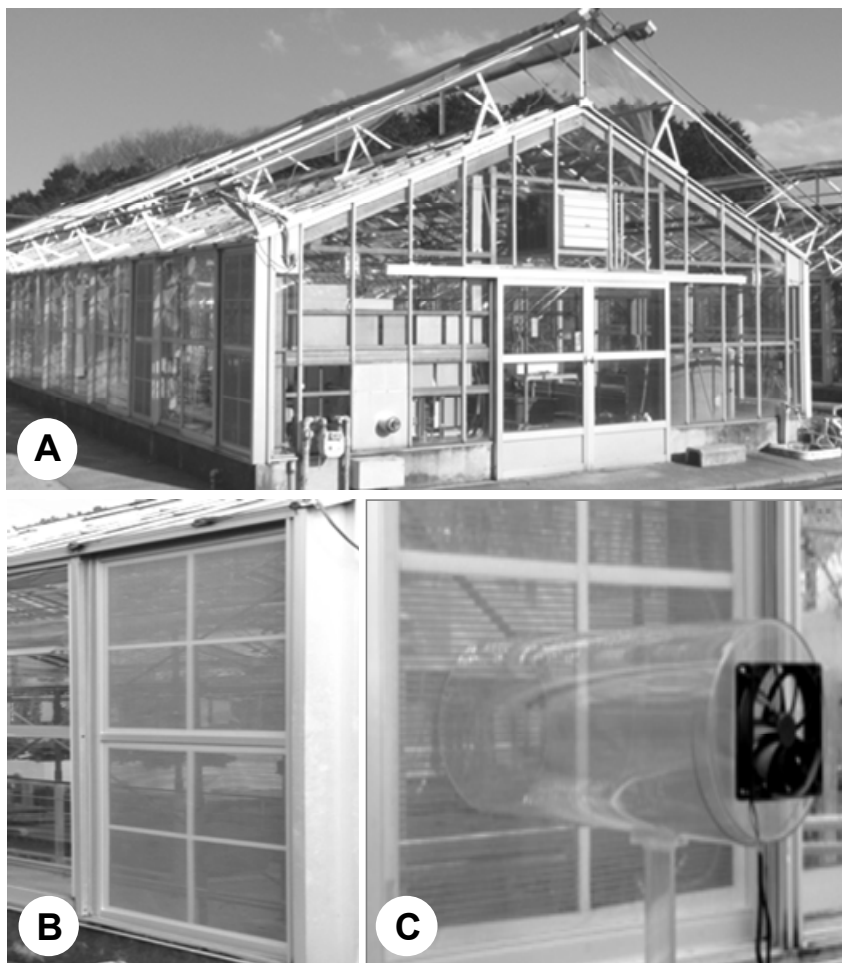
Figure 2. A greenhouse (A) used in the present study, an electric field screen installed on a lateral window (B) and a transparent acrylic cylinder with an electric fan used to test insect avoidance of the screen (C)